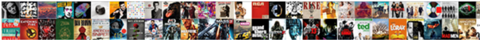
Tableau Extensions Api Documentation